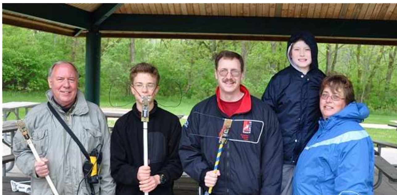
Mini Fox Hunt – They had fun but it looks like it was chilly.