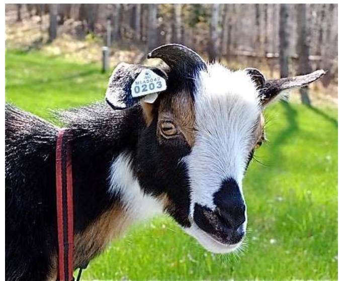
Don't let Don, WA4FRJ, get your goat!!!