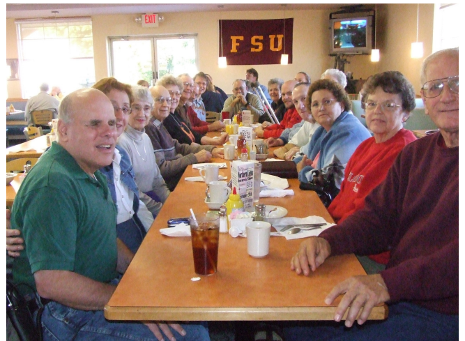
A fine group of satisfied customers for the Club Breakfast on September 29 at Crankers in Big Rapids.

Thanks to everyone for a job well done. You are what this thing called ham radio is really all about.