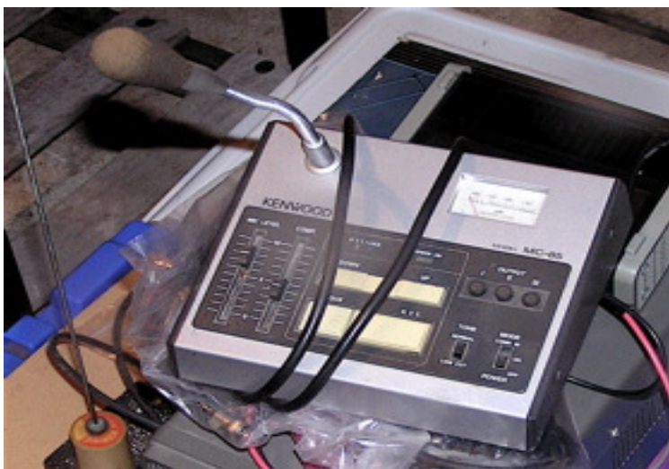
Kenwood Mike Active Mike console $65