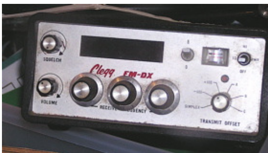
CleggXCVR - $60 Make offer