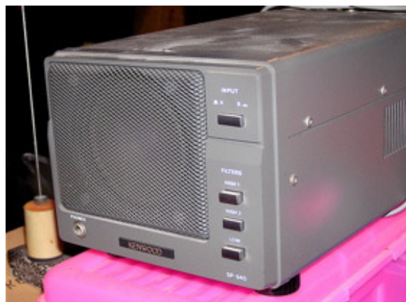
Kenwood SP940 Active Speaker to go only with TS940S Transceiver $50