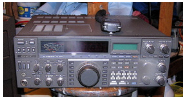
Kenwood TS940S 10-160 Transceiver Asking $400