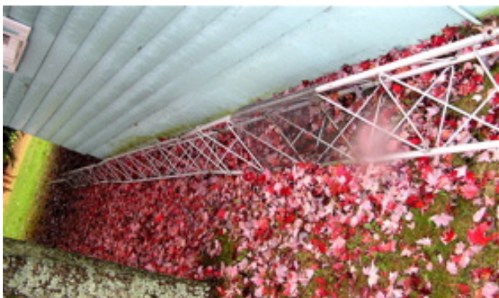
35' tower – price yet to be established